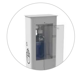
Easy to replace the gel bottle