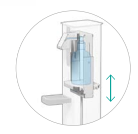
For different bottle