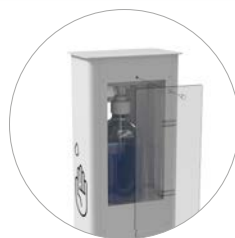
Easy to replace the gel bottle