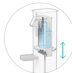
For different bottle sizes