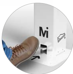
Foot activated dispenser