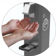
Removable tray to collect excess gel